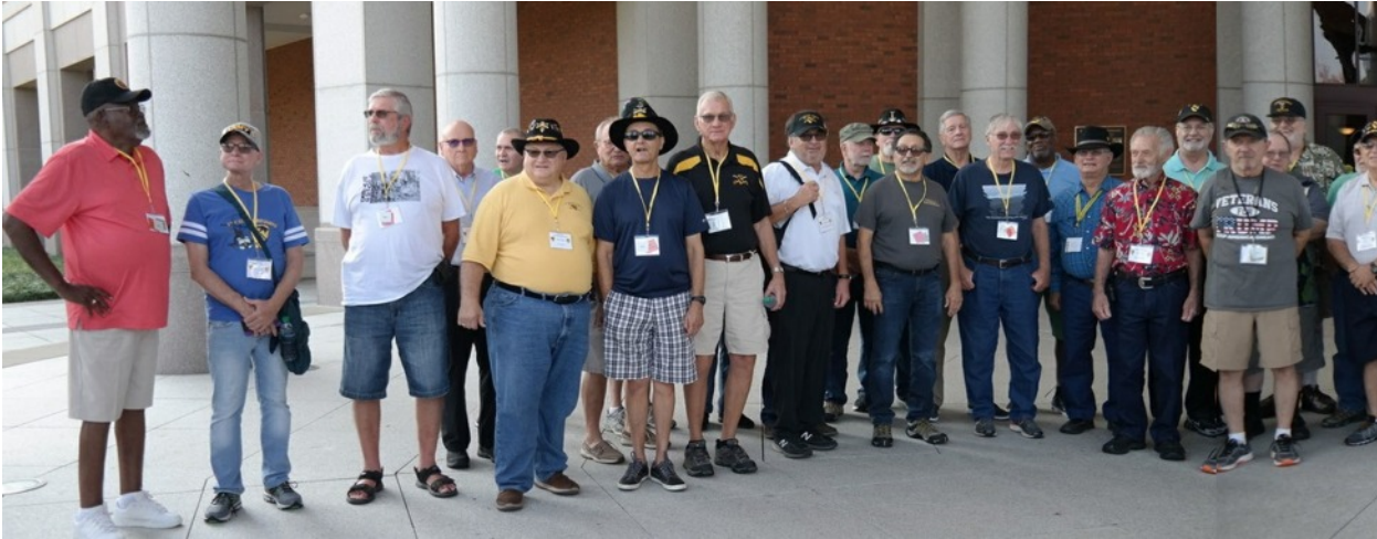
2019 Reunion - D Company Veterans visit the N