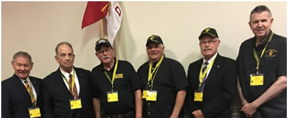
1968 Company CP, 2018 Reunion