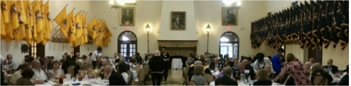
2019 Banquet - Regiment Room at Fort Benning Georgia

FOR HE TODAY THAT SHEDS HIS BLOOD WITH ME SHALL BE MY BROTHER FROM THIS DAY TO THE ENDING OF THE WORLD