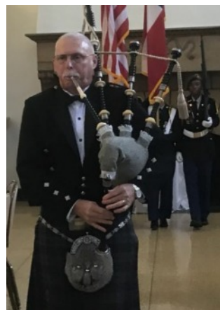
Piping in the Colors 2019 Reunion Banquet

Hotel Check-out Or stay another night to see a Las Vegas show, same rate. We don't know what those may be in September 2021, but this site should be updated as informaton becomes available: https://www.vegas.com/shows/