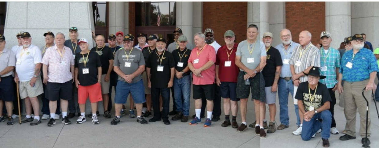
National Infantry Museum in Columbus, Georgia