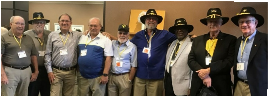
1970 1st Platoon, 2019 Reunion

join men who experienced what you did, with whom you shared a foxhole, carried a radio, walked point, laid in an ambush, or on a night LP, shared a Huey skid on final approach to an LZ, your gut wrenching, wondering, will it be "hot"?