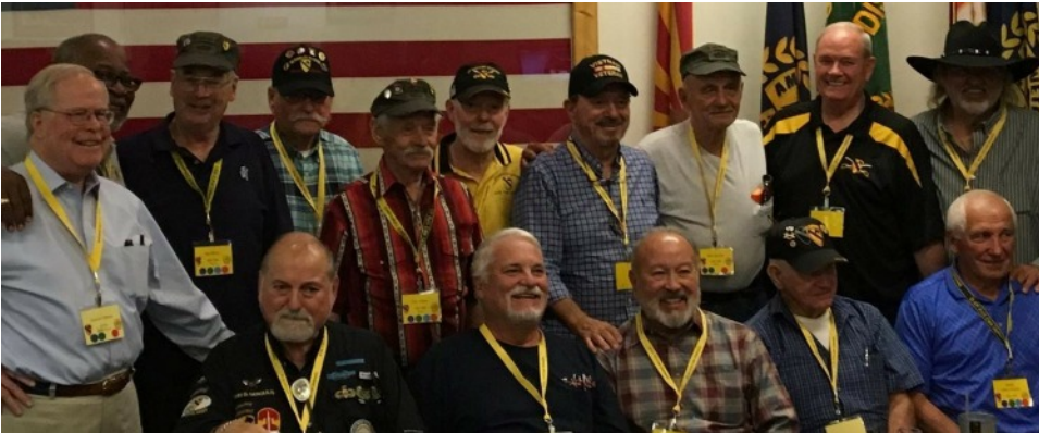
1965-66 Recon Platoon, 2017 Reunion